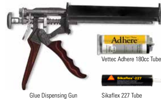
Glue Dispensing Gun

The following accessories are required for Easyboot Glue-On application and can be purchased through EasyCare at easycareinc.com, or by phone at 800.447.8836